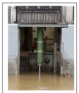
Fig.2 - Electro-hydraulic drive - general outlook