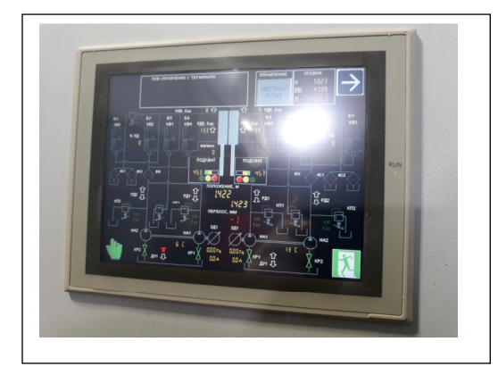
SCADA touch screen for local control of the gate at the navigation lock

Working and spare proportional throttle cartridge valve: control signal changes only when nominal gate velocities change during lowering (acceleration at the beginning and deceleration at the end of manipulation).